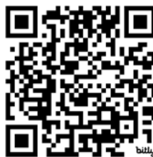
Junior and Senior Years Application